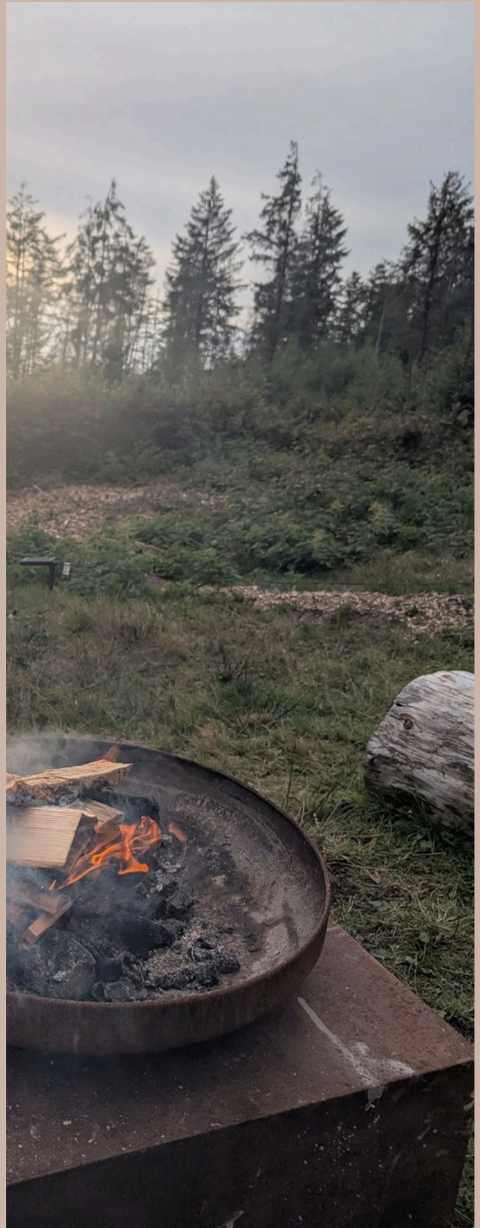
YOU CAN SAUNA - HALDON FOREST